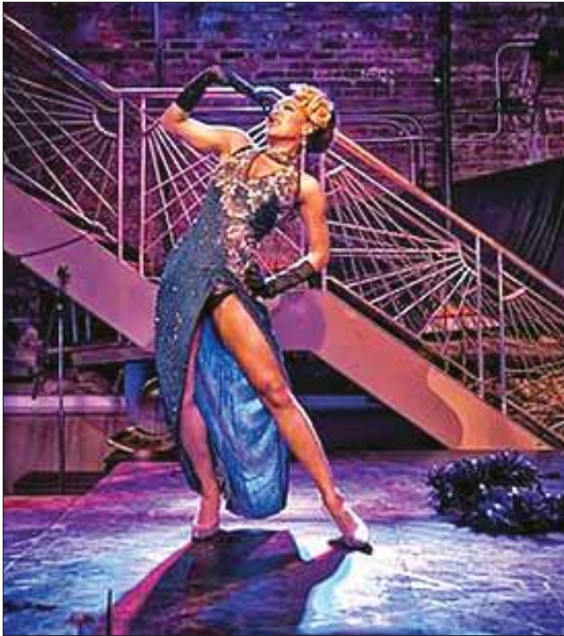
"Burlesque Below the Bridges" will be at the Bridges in DUMBO on Saturday, Dec. 19.

A free two-hour tour from New York City's premier Street Art Walking Tour.