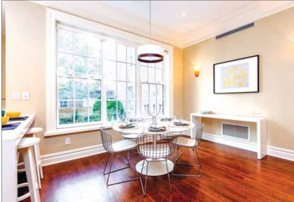
A look inside 113 Willow St.

Upon entering, the parlor floor offers approximately 1,200 square feet of stunning living and entertaining space, with two original marble wood-burning fireplaces, ample living and dining space, a paneled chef's kitchen and direct access to a pri-