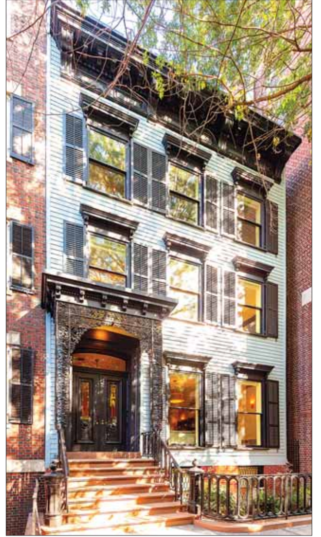
The exterior of 113 Willow St.

— Information from Douglas Elliman Real Estate