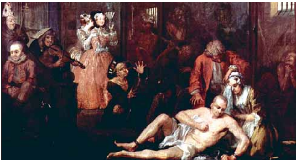
The String Orchestra of Brooklyn presents "The Rake's Progress" on July 21-23 at Roulette, 509 Atlantic Ave.

Where: Greenwood Heights/Green-Wood Cemetery (500 25th St.)