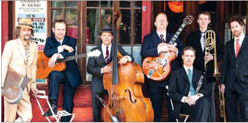
Blue Vipers of Brooklyn will perform at "Live at the Archway" in DUMBO on Thursday, July 21.

Where: DUMBO/The Archway (Water Street at Anchorage Place)