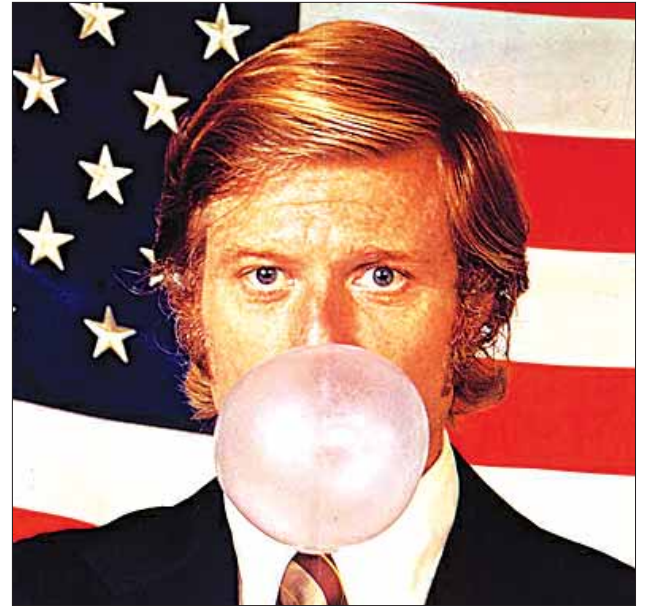
BAM Rose Cinemas presents "Four More Years: An Election Special" daily, through Aug. 23.

Sing, act, dance and draw. Come to Pier 6 for a weekly celebration of the arts. Engaging activities will vary each week and be accompanied by an out-